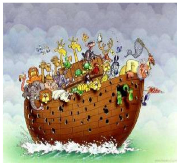
The woodpecker might have to go!